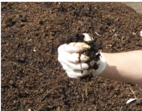
Optimum moisture content for compost is 40-60%, damp enough so that a handful feels moist to the touch, but dry enough that a hard squeeze produces no more than a drop or two of liquid.

Time in all systems depends on mixes, moisture and airflow. With well-balanced mixes, turned or unturned, compost can be produced within 6 months. Creating a good habitat for microorganisms helps the process work better. By balancing your browns and greens and checking your moisture content (see squeeze test pictures below) you can create a mixture that allows air to flow evenly through the pile. This “passive” air flow can produce the same results as turning. Keeping that stockpile of coarse carbon on hand will help achieve this. With less optimum conditions, it will take from 6 months to a year or more to produce finished compost. With rotating drum composters, continuous composters and worm composters, finished compost can be created in a relatively short time of 6 months or less.