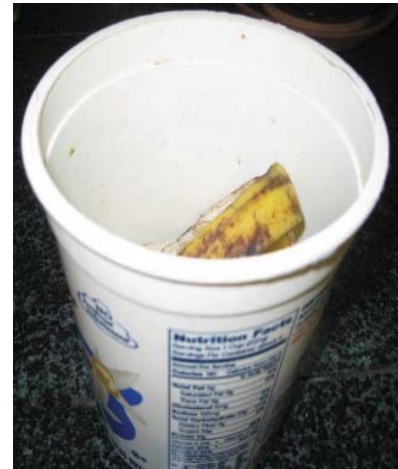
Recycled kitchen container.