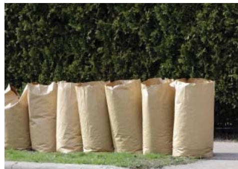
Paper leaf bags.

♦ Paper bags: Paper leaf bags can be a good choice since they have a base that allows them to stand up while loading, and can be incorporated into the compost along with the leaves which avoids the debagging process. However, they can be more expensive to purchase.