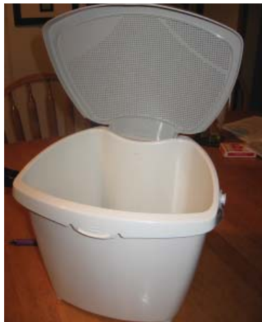
Kitchen container with locking lid and aeration holes.