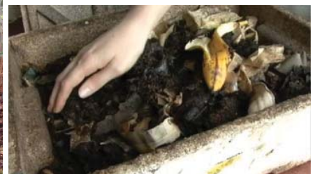
Indoor worm box.