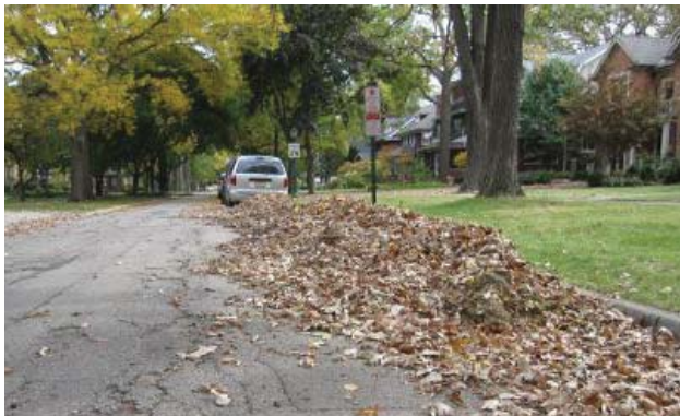
Loose leaves curbside .