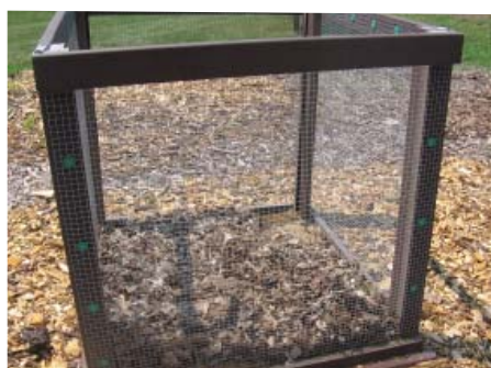
Homemade on-ground compost units.

These units sit directly on the ground so that worms and other decomposers can come up from the soil to assist in the composting process. Whether homemade or purchased, these types of composters can be used as holding bins or can be