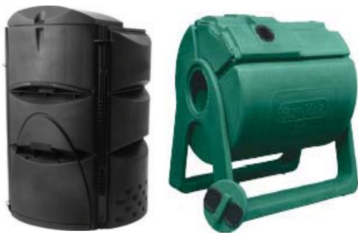
Manufactured continuous feed compost units.

◆ Continuous Feed Compost Units: These composters are designed to be fed daily. Feedstocks go in one end and compost comes out the other. These include rotating drum and bin composters that are designed specially to push waste through the system, and also include indoor, electric composters.