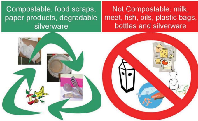
Example signage for home separation.

Any food preparation or post plate material, spoiled food, napkins, and degradable serviceware can be composted. Milk and meat products are not generally added to home compost piles, but can be composted by municipalities collecting organics because they compost greater volumes of residuals and reach proper temperatures. Signage can help while learning what to put into the containers and where many people use a shared kitchen.