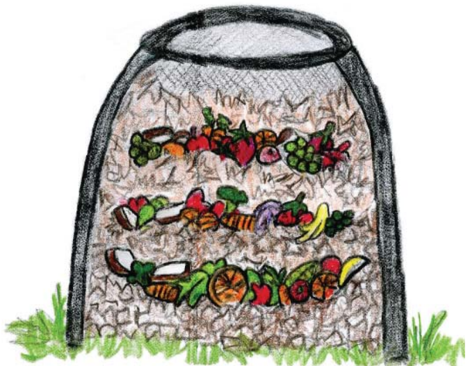
Cross-section of layered browns and greens.

Layering and choosing the right organic material creates the right environment for compost to “happen”. Start with a layer of coarse “browns” in contact with the soil. Make a well or depression in this layer and put the “greens” into the well. Keep the food scraps away from the outside edges of the pile (only brown material should be visible). Cover your “greens” with a generous layer of “browns” so that no food is showing. This will keep insect and animal pests out of the pile and filter any odor. Keep adding layers of greens and browns (like making lasagna). Keep layering the feedstock until the mass reaches a height of 3 to