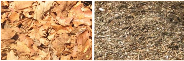
Browns: Leaves and wood chips.