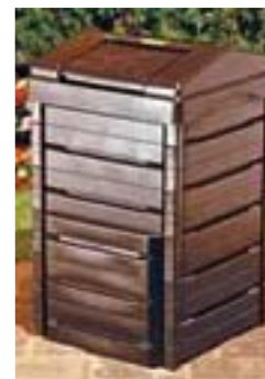
Manufactured on-ground compost units.

a product more quickly, turning will help to speed the process. The pile can be turned with a pitch fork or shovel, which helps to break up material and better homogenize the mass.