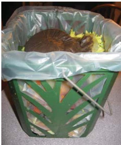
Kitchen container with compostable bag.