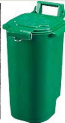
Reusable curbside collection containers.