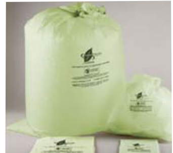
Compostable plastic bags.

♦ Compostable plastic bags: These bags are designed to be incorporated into compost windrows with the yard waste and no debagging should be necessary. These bags tend to be more expensive than the petroleum-based bags but may save in labor.