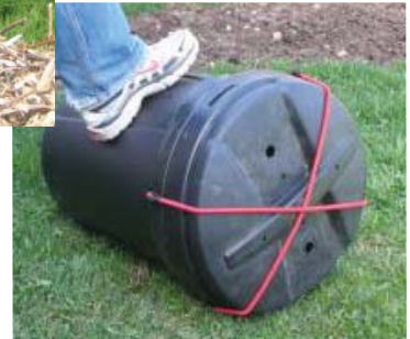
Homemade rotating drum compost units.