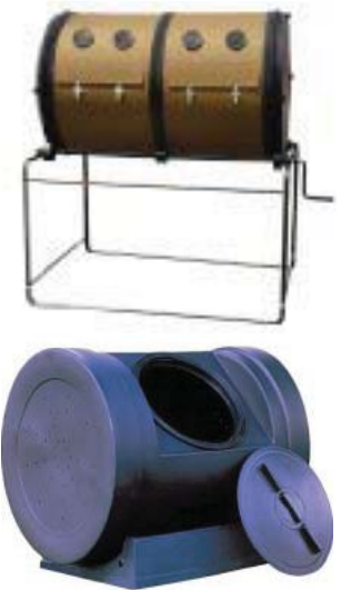
Manufactured rotating drum compost units.